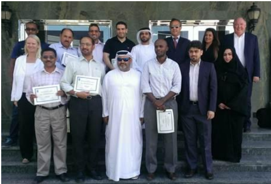
Participants and instructors from the GSN 2: Airside Operations and Safety training, held 09–13 March in Abu Dhabi, UAE.